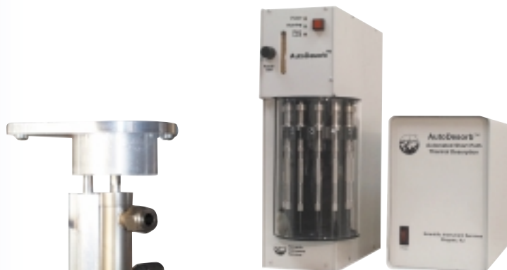
AutoDesorb™ Model 2000

SIS offers a complete line of DIP, DEP, FAB, and calibration probes for mass spectrometers. Our custom design and manufacturing services can add functionality to almost any mass spectrometer or vacuum system.