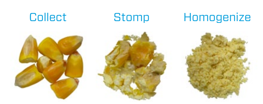
Step 1: Place your sample in the tube.

Use it with the Bullet Blender® homogenizer to process samples like soybeans, shells, and corn!